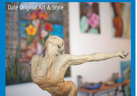
Dale Original Art &amp; Style