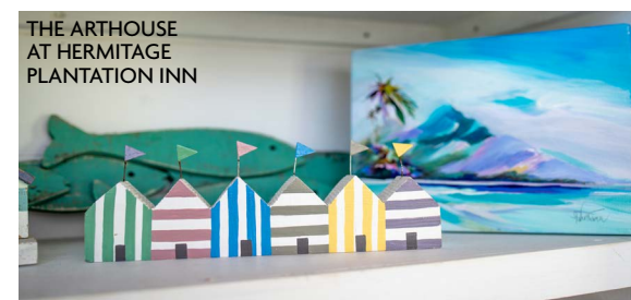
THE ARTHOUSE AT HERMITAGE PLANTATION INN

• L&L Rumshop in Charlestown has the biggest selection of rums on island as well