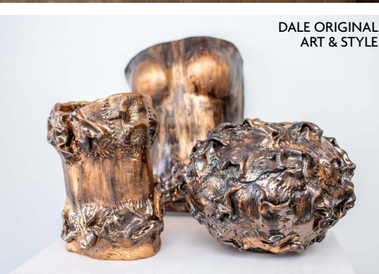
DALE ORIGINAL ART & STYLE