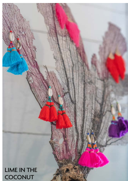
LIME IN THE COCONUT

• For one-offs made locally, the 10 shops and 19 craft vendors at the Nevis Artisan