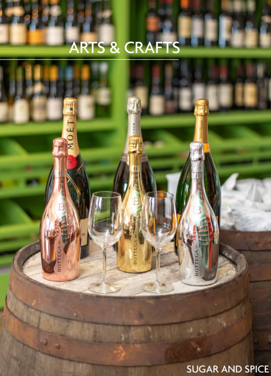
SUGAR AND SPICE