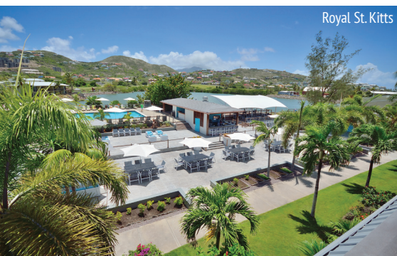
Royal St. Kitts